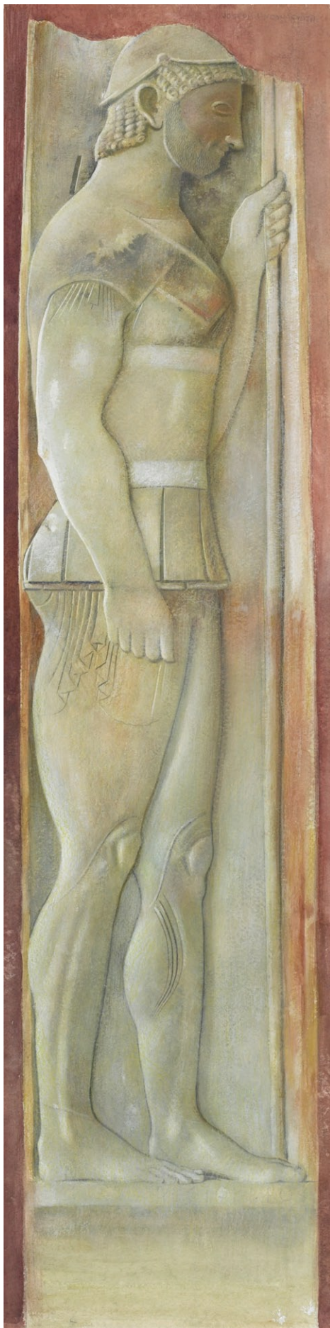
FIG. 4: Joseph Lindon Smith, STELE OF ARISTION, AFTER ARISTOKLES, c. 1886–89. Watercolor and gouache over graphite on cream wove paper, 78 x 20.1 cm. Fogg Art Museum, Bequest of Edward W. Forbes, 1969.37.