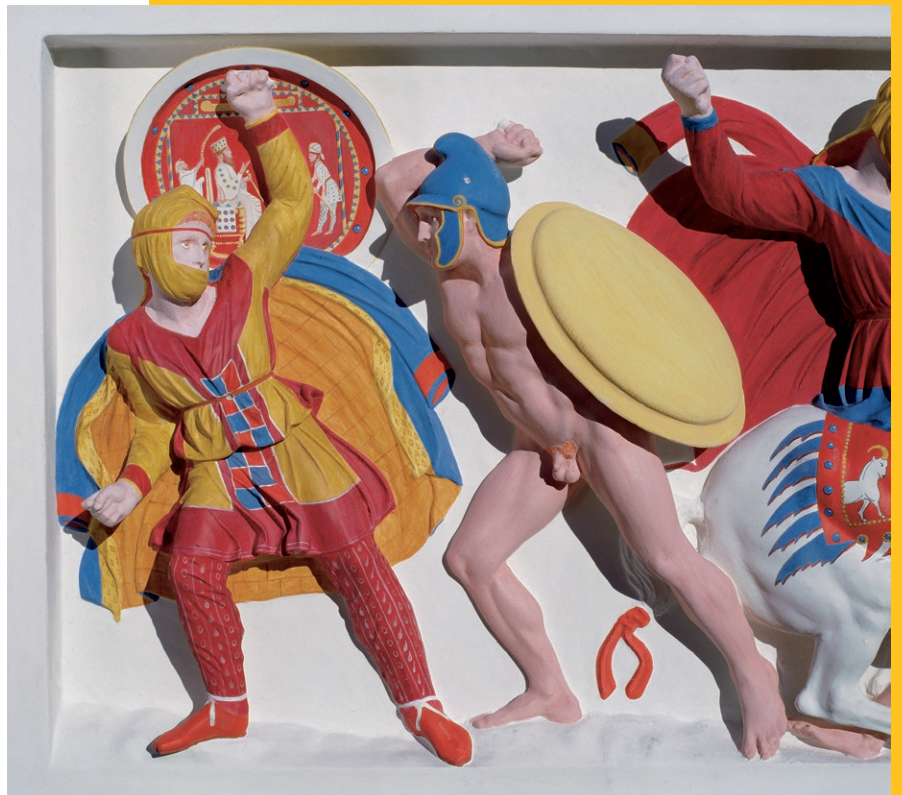
FIG. 3: “ALEXANDER” SARCOPHAGUS, detail of color reconstruction: a Persian and a Macedonian fighting.