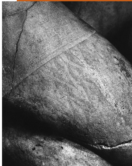
FIG. 8: WEST PEDIMENT OF THE TEMPLE OF APHAIA ON AEGINA: TROJAN ARCHER, detail. UV light reveals formerly painted patterns on trousers and jacket.