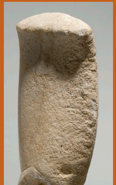
FIG. 7: HEAD OF A FEMALE FIGURE OF THE SPEDOS VARIETY, Early Cycladic II, 2500–2400 BC. Marble, h. 10.2 cm, Arthur M. Sackler Museum, The Lois Orswell Collection, 1998.243. Raking light shows a curled lock on the side of the head.