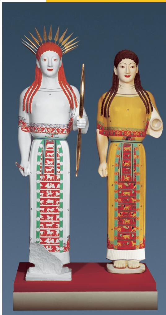
FIG. 2: “PEPLOS” KORE, two alternative color reconstructions: with bow and arrows as the divine huntress Artemis, and with her dress painted in yellow ochre.

The new evidence for painted marble gave rise to colorful reconstructions on paper, especially of Greek temples, and a lively discussion about the extent to which the ancients would have colored their sculpture—and whether modern sculptors should follow their model. Antoine-Chrysostome Quatremère de Quincy opened the debate in 1815 with his treatise on Pheidias’s statue of Zeus at