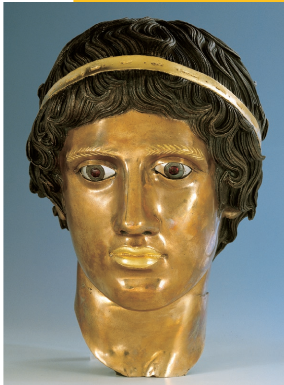
FIG. 10: HEAD OF A YOUTH. Color reconstruction.