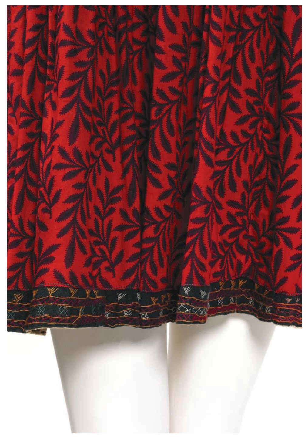
Plate 27. Barbara McLean. Dress, ca. 1967. National Gallery of Victoria, Australia.