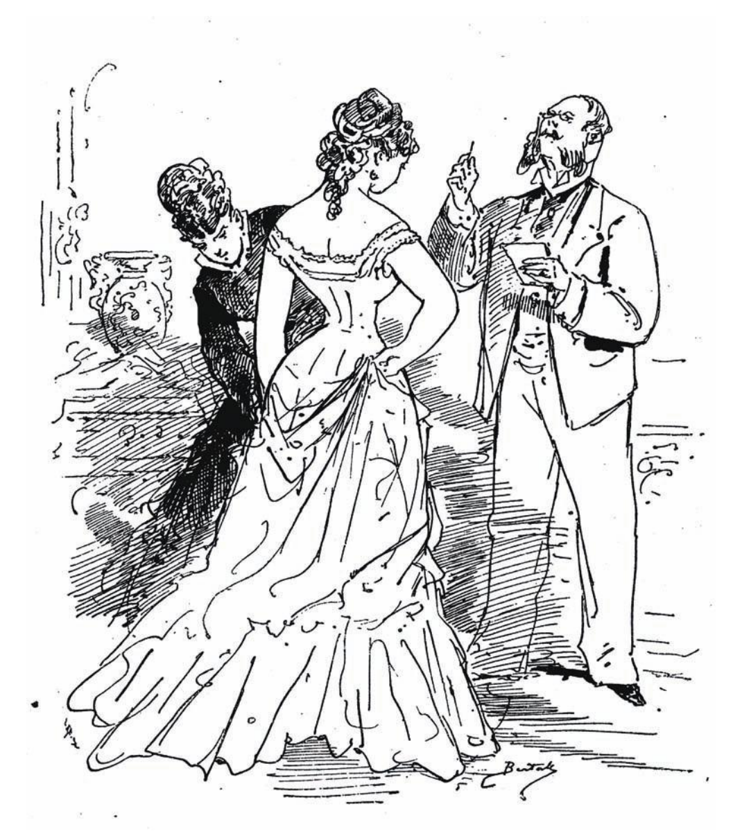
Plate 1. Caricature of Charles Frederick Worth, from Bertall, La Vie Hors de Chez Soi (Comédie de Notre Temps, vol. 3) (Paris: E. Plon, 1876), 331. Copyright status: public domain (copyright expired).