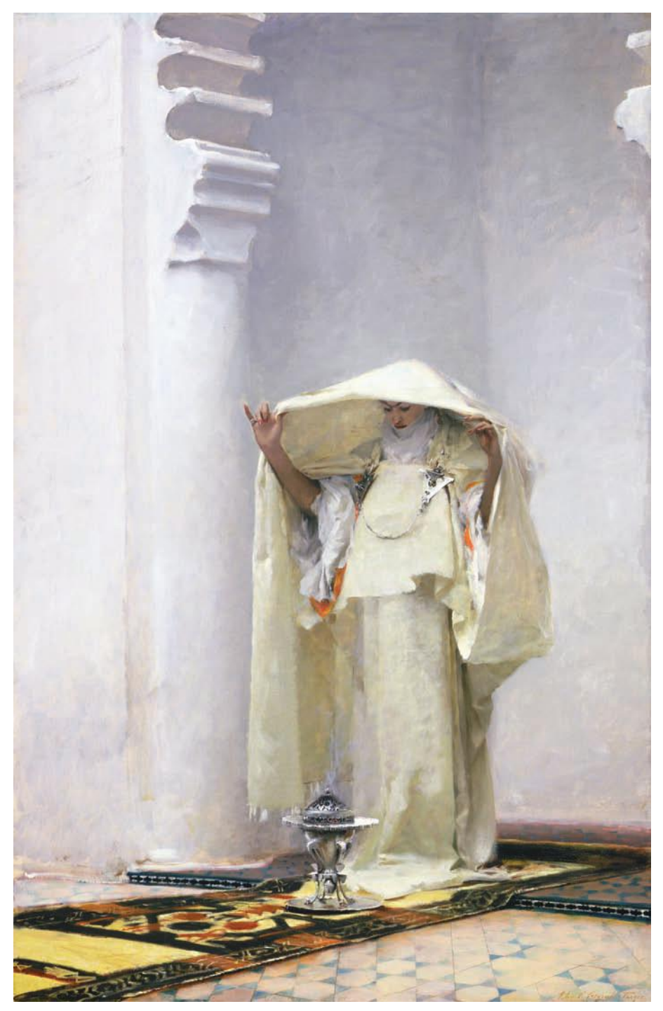
Plate 11. John Singer Sargent (1856–1925). Fumee d'Ambre Gris, 1880 (oil on canvas).