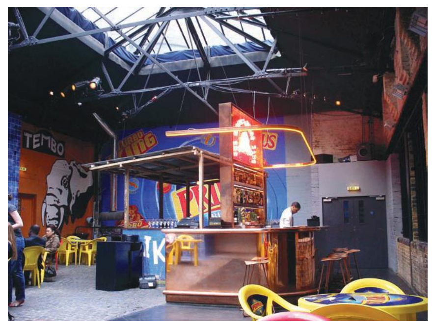
Plate 30. The Double Club, 2009. Private collection.