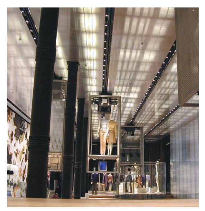
Plate 28. Prada epicenter store, 2001. New York. Private collection.