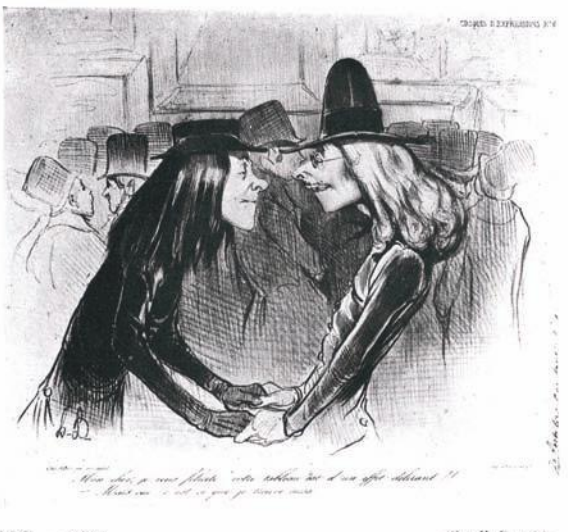
471. – MON CHER, JE VOUS FÉLICITE... (L. 284 millim.; H. 323)