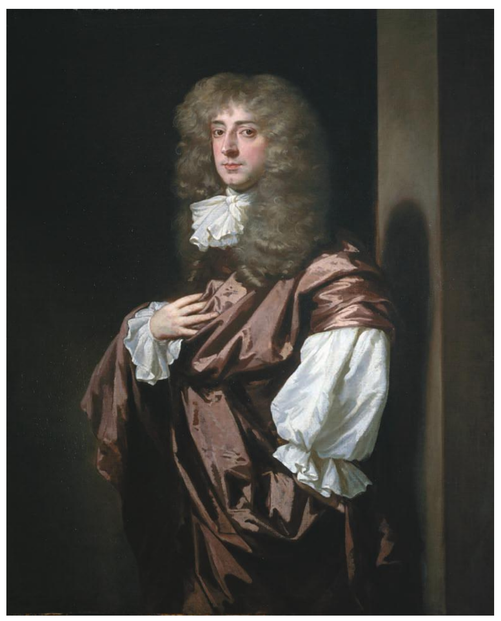
Plate 33. Peter Lely (1618–1680). Portrait of Sir Thomas Thynne, Later 1st Viscount Weymouth . Oil on canvas, 125 x 102.2 cm. The Samuel Courtauld Trust. The Courtauld Gallery, London.