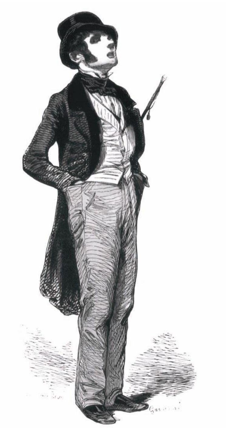
Plate 23. Flaneur, from Les Francais peints par eux-memes: Encyclopedie Morale du dixneuvieme Siecle, vol. 4 (Paris: L. Curmer, 1841), 63.