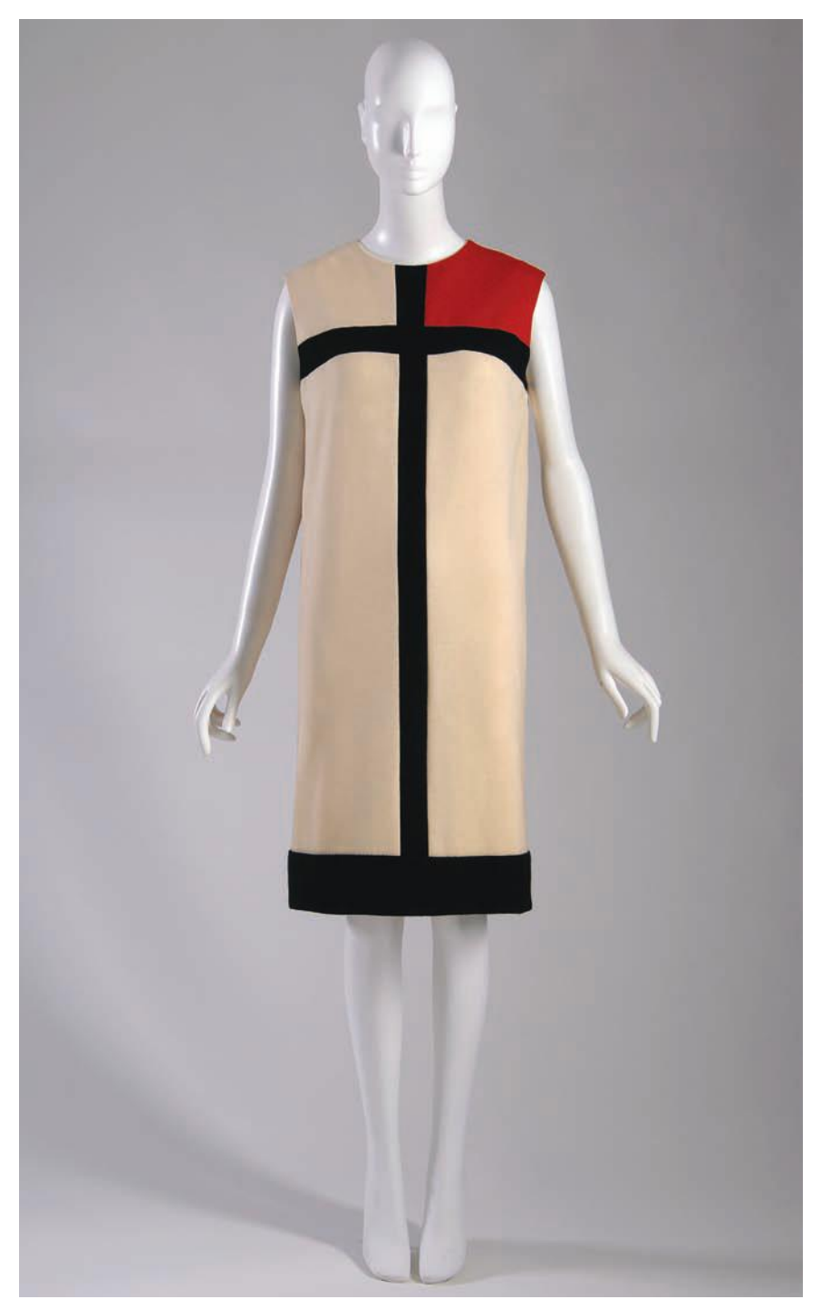
Plate 3. Yves Saint Laurent. Mondrian dress in wool jersey with pieced geometric design, 1965. The Museum at F.I.T., New York, Gift of Igor Kamlukin, 95.180.1, Photograph © The Museum at F.I.T.