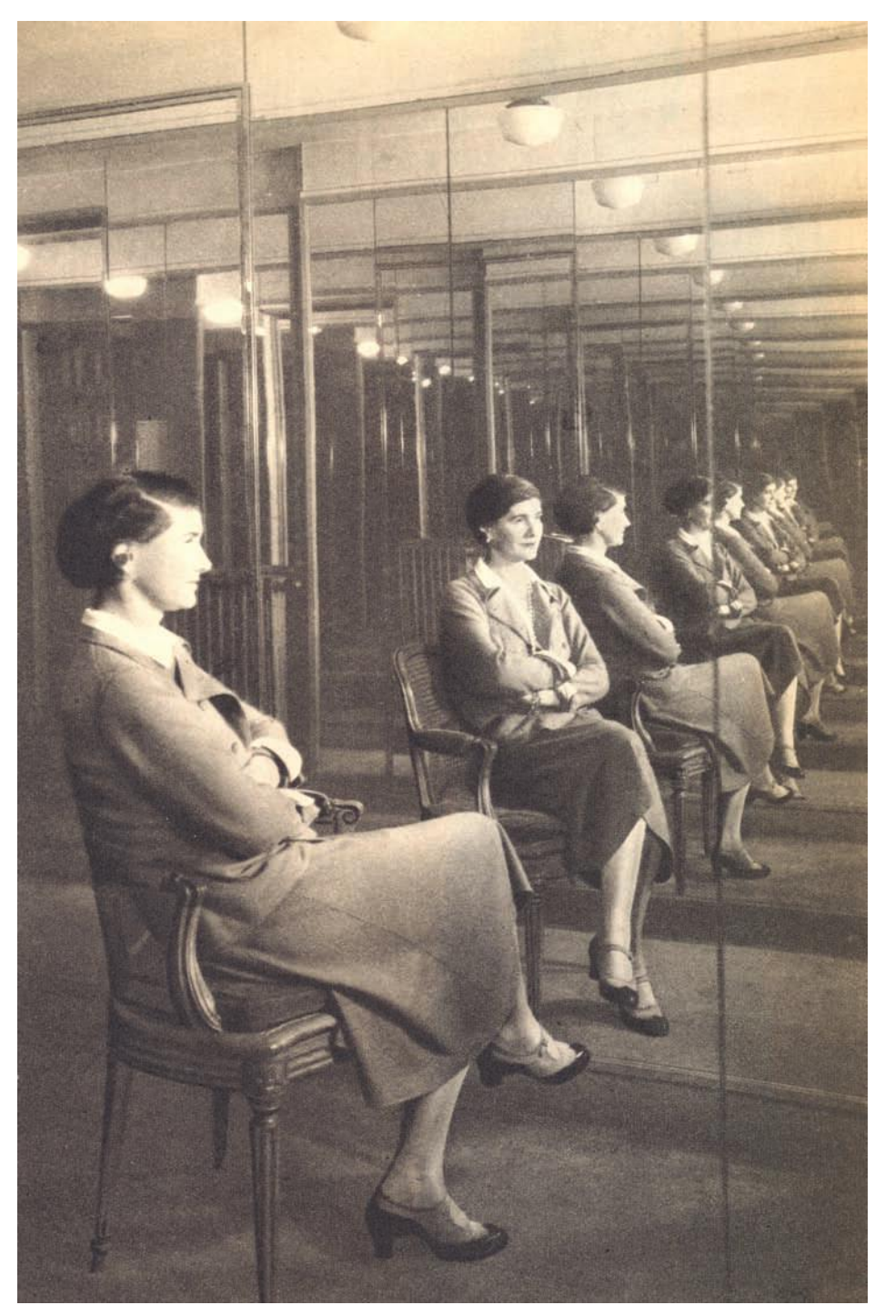
Plate 2. "Coco Chanel." Photo by Buffotot, Paris. From Käthe von Porada, Mode in Paris (Frankfort-am-Main: Societäts-Verlag, 1932), 109. Copyright status: public domain (Societäts-Verlag ceased operations in the mid-1930s and had no successor company; copyright lapsed).