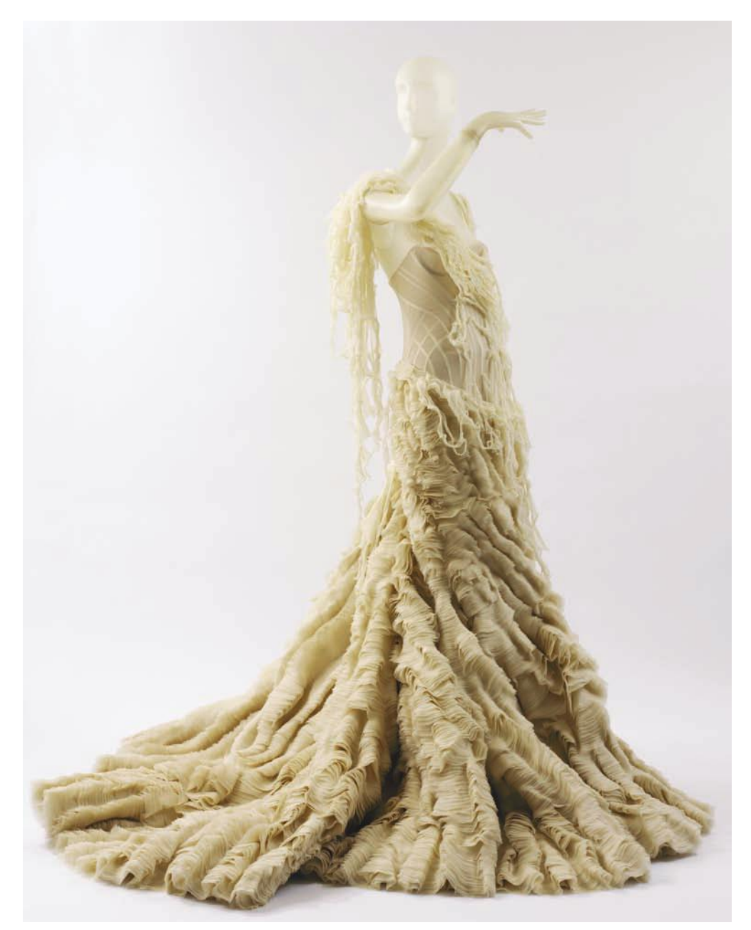
Plate 12. Alexander McQueen (British, 1969–2010). Oyster dress. Spring/Summer 2003. Ivory silk georgette and organza, beige nylon and silk chiffon, white silk. Length at CB: 72 inches (182.9 cm). The Metropolitan Museum of Art, New York. Purchase Gould Family, in memory of Jo Copeland, 2003.