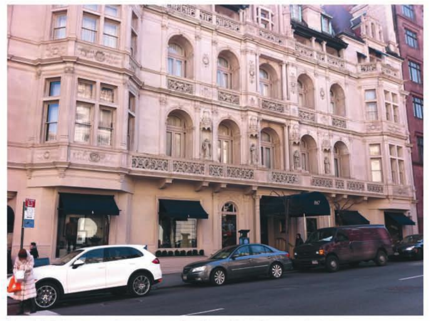
Plate 34. Ralph Lauren flagship store, New York. 2011. Private collection.