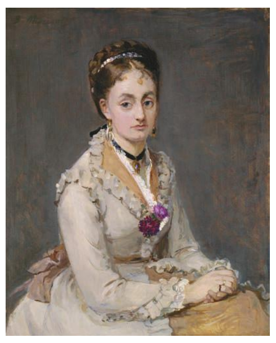
Plate 31. Berthe Morisot (1841–1895). Portrait of a Woman , 1872–1875. Oil on canvas, 56 x 46.1 cm. The Samuel Courtauld Trust. The Courtauld Gallery, London.