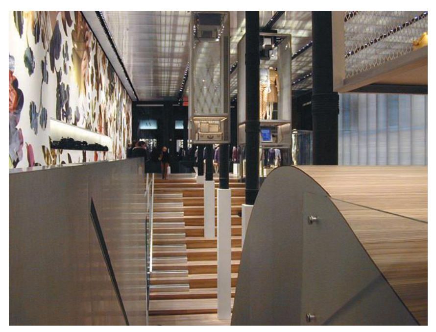
Plate 29. The Wave, Prada epicenter store, 2001. New York. Private collection.