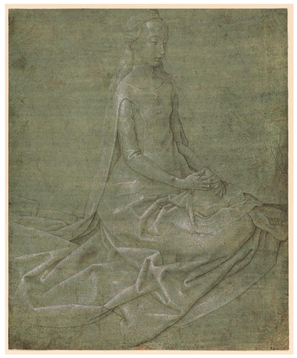
Plate 32. Hugo van der Goes (ca. 1440–1482). Seated Female Saint, 1475 (ca.). 18.9 x 23 cm, brush and ink and body color (white) on paper (green prepared). The Samuel Courtauld Trust. The Courtauld Gallery, London.