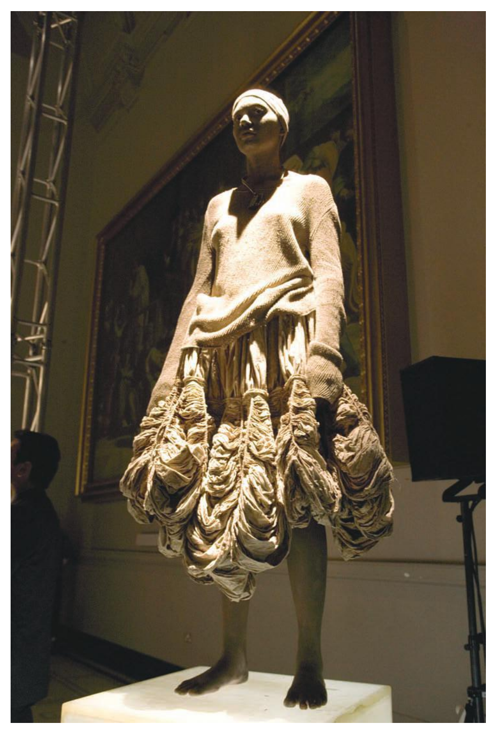
Plate 10. Ma Ke. Wuyong collection. Fashion in Motion, Victoria and Albert Museum, London, 2008. Designed by Ma Ke Wuyong.