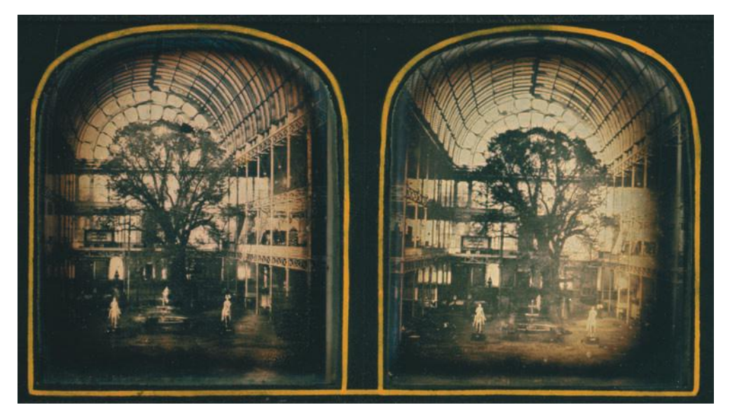
Plate 38. "Stereoscopic View of the South Transept," the Great Exhibition, photographer unknown, 1851. Library of Congress.