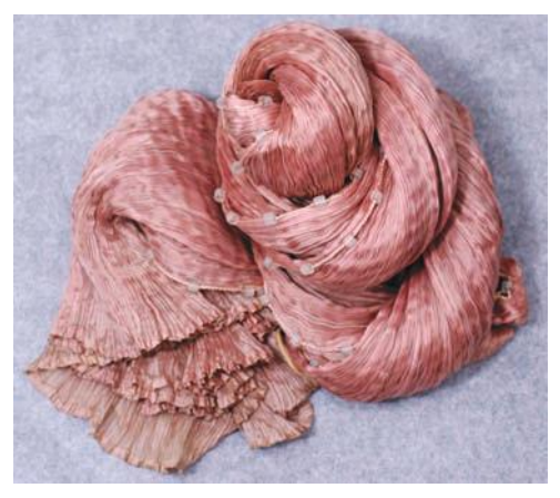
Plate 19. Mariano Fortuny. Delphos tunic, 1909.