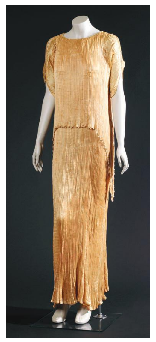
Plate 18. Mariano Fortuny. Delphos tunic, 1909.