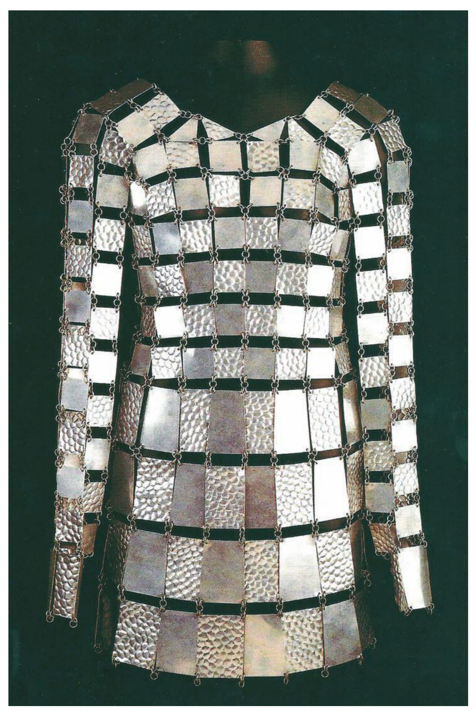
Plate 15. Paco Rabanne. Dress made of hammered metal, 1968.