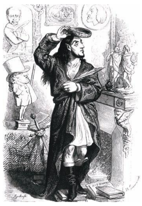
Plate 22. Artist in Historical Costume, from Les Francais peints par eux-memes: Encyclopedie Morale du dix-neuvieme Siecle, vol. 3 (Paris: L. Curmer, 1841), 63.