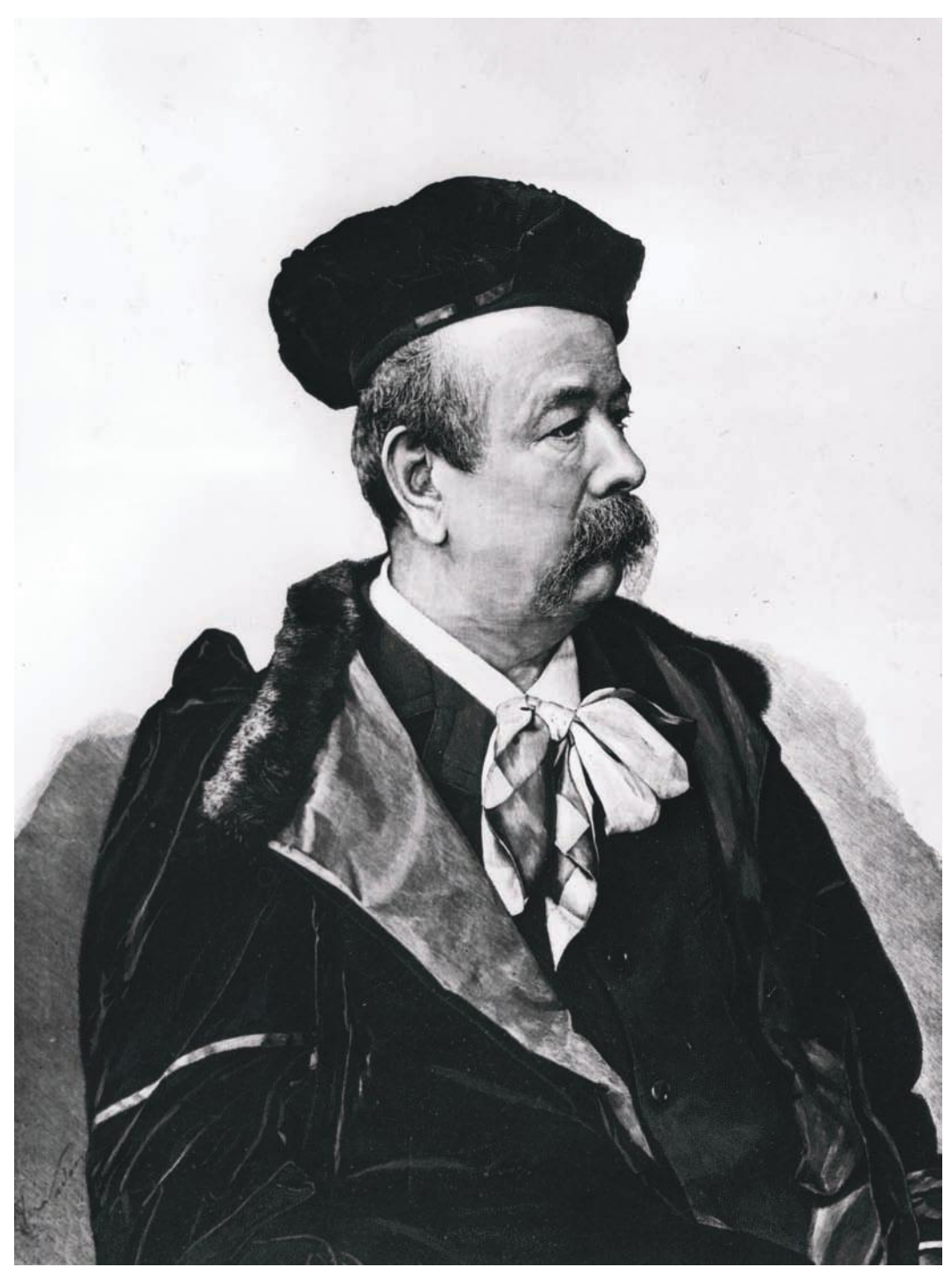
Plate 7. "Charles Frederick Worth."